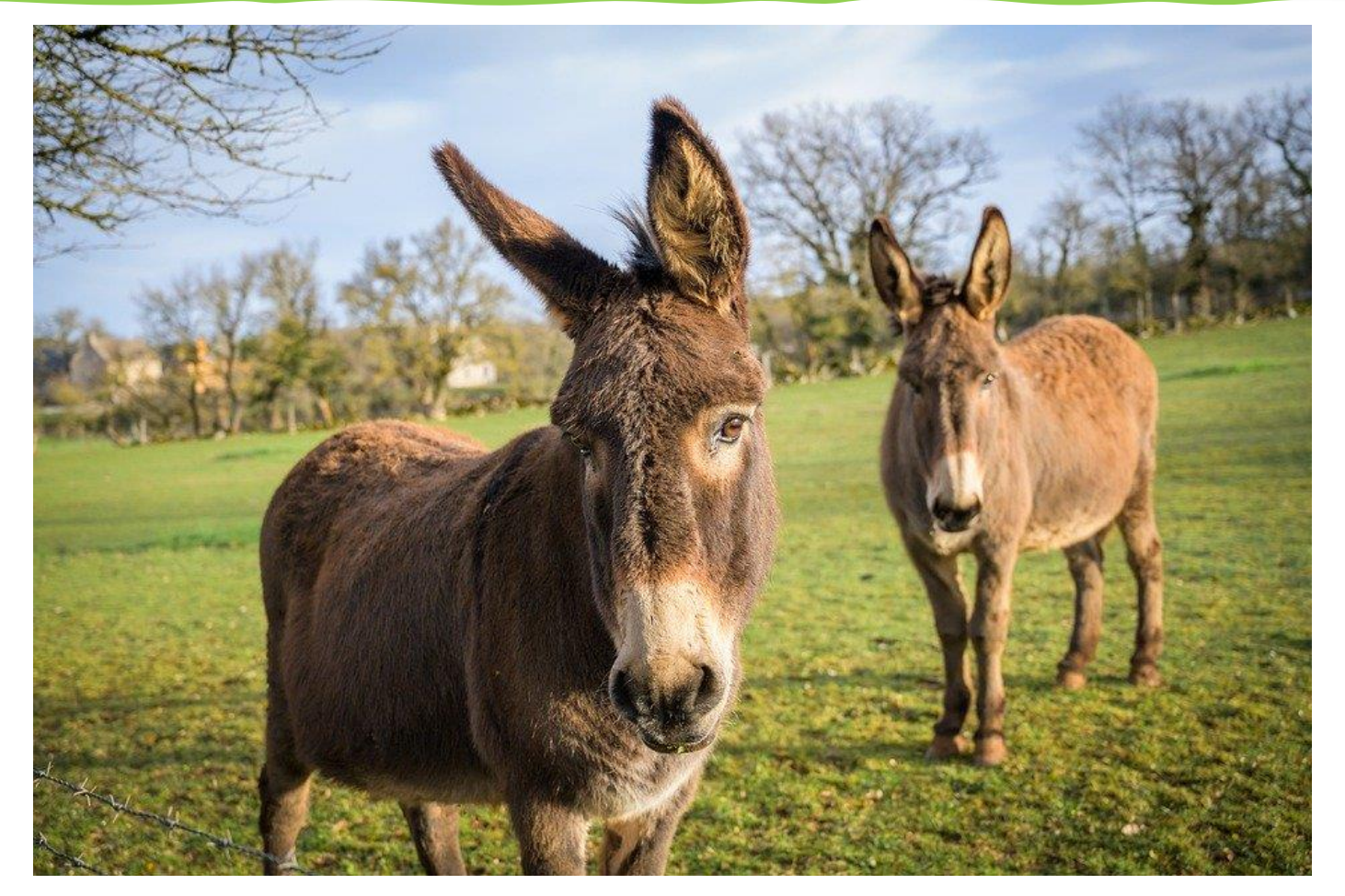
Do you see the donkey? It says, "heehaw!"