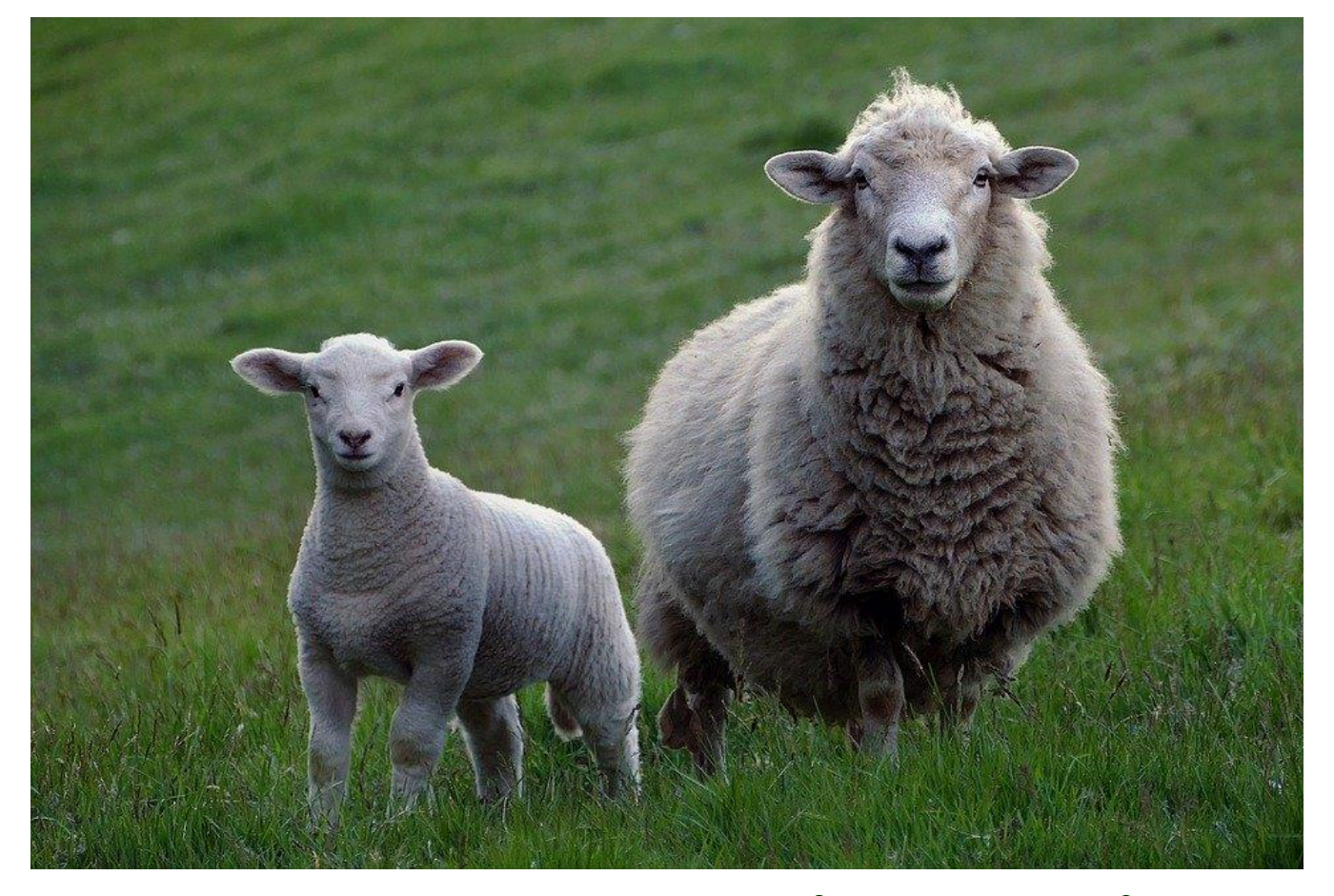
Do you see the sheep? It says, "baa!"