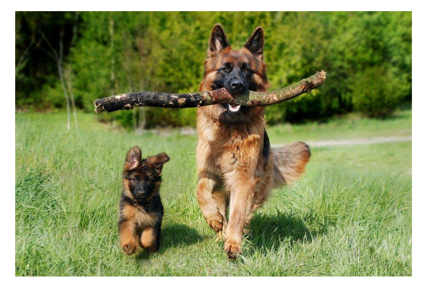
Do you see the dog? It says, "woof!"